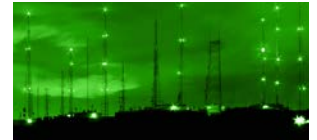
Night Vision Compatible version available. See flightlight.com for details.