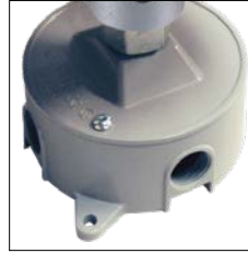
Optional Low Surface Mount