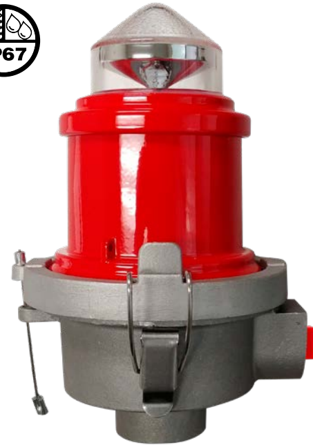
Single L-810 LED Steady-Burning Red Obstruction Light