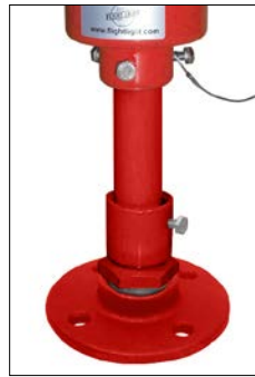
Shown with Riser, Frangible Coupling and Floor Flange