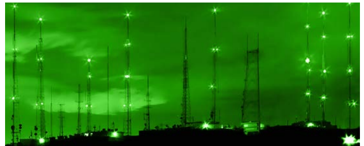
Night Vision Compatible Obstruction Light