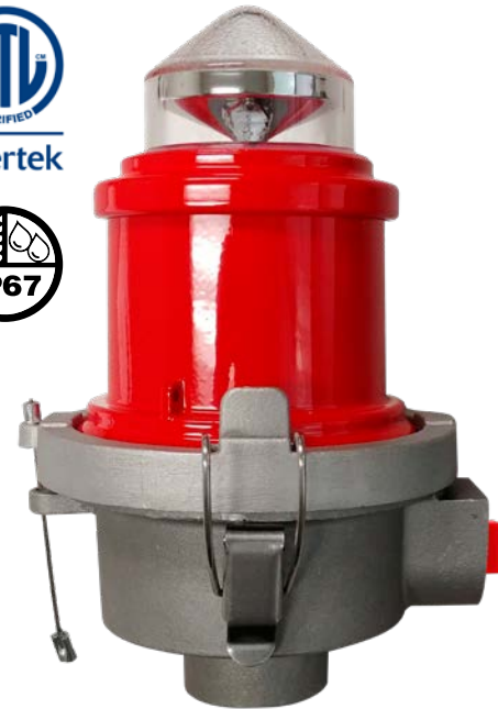
Single L-810 LED Night Vision Compatible Obstruction Light