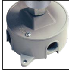
Optional Low Surface Mount