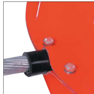
Requires only four bolts to clamp it to the wire