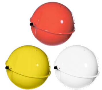
Available in Orange (standard), Yellow or White