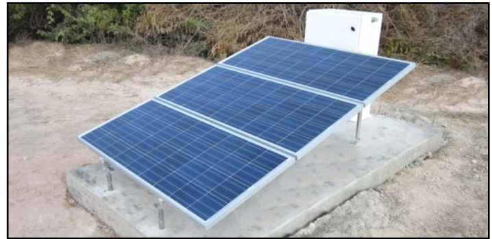
Solar Power Option

The solar power option equips the system to run with free, renewable energy from the sun. Unprecedented in the industry, this green feature is the ideal long-term investment. Ongoing savings afforded by utilizing solar energy are calculated over the lifetime of the installation. Custom solar packages are available to fit your specific load requirements.