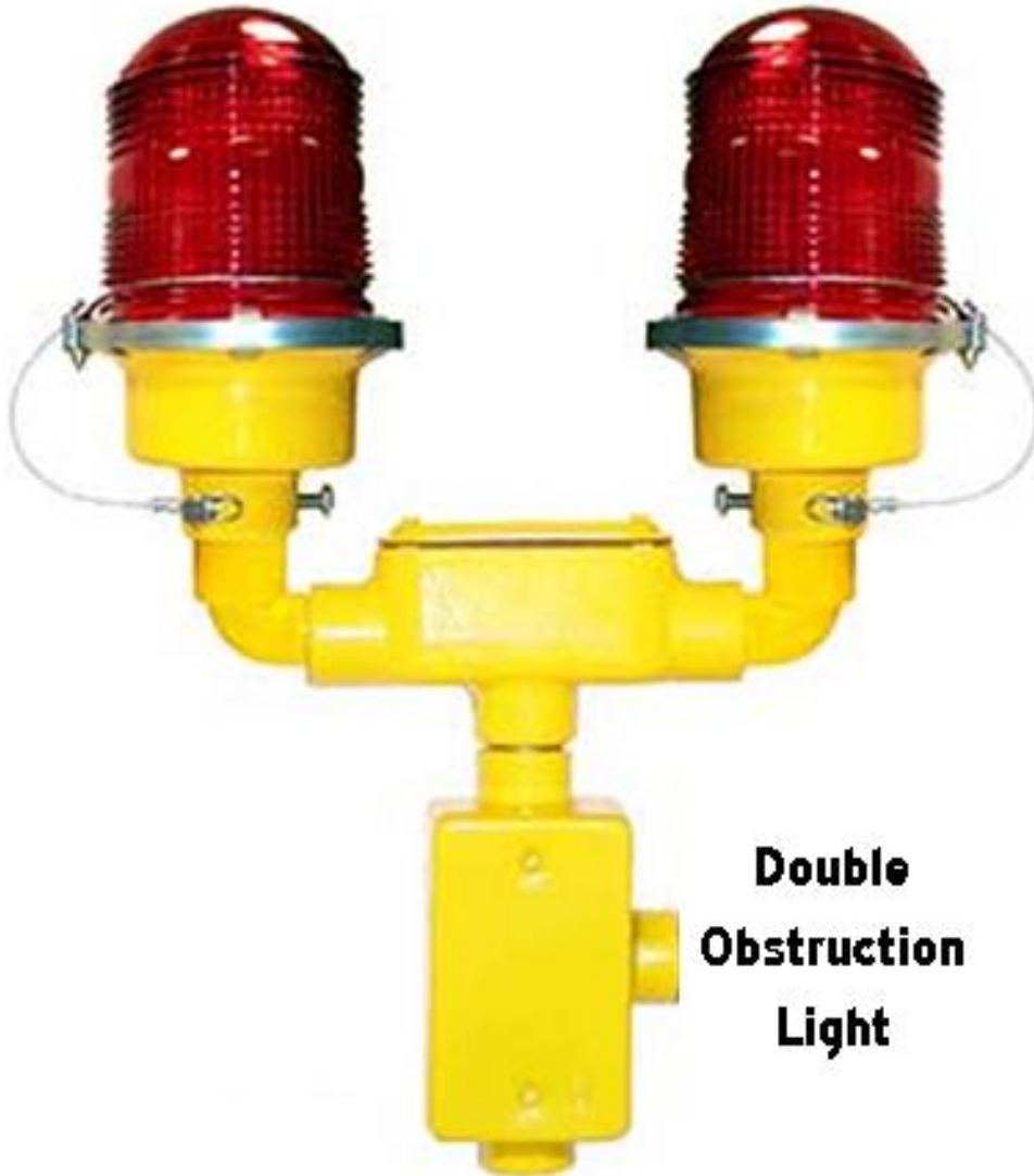
Double Obstruction Light

Flight Light, Inc. 2708 47 th Ave. Sacramento, CA 95822 (916) 394-2800