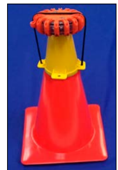
PowerFlare lights without magnets attach to the CTA-001 with included elastic cords.