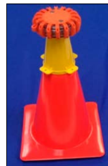
Magnetic PowerFlare lights attach to an internal piece of metal in the CTA-001.